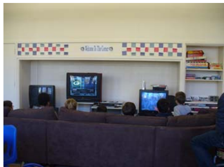
Game room and lounge area at The Corner

The Corner is located at the Town Center Building 12 Mudge Way, Bedford, MA 01730 Recreation Department: 781-275-1392 Corner Direct Line: 781-953-3014